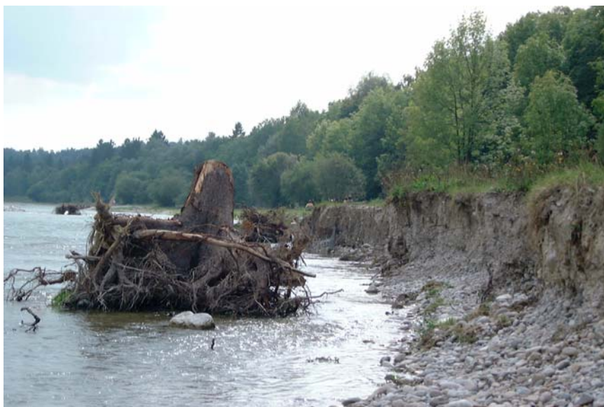
Fig. 6: Dynamic bank development with vertically dropping bank washouts (rootstock)

The area of the recovered section stands out distinctly where it intersects with the next and final river section that is still designed like a canal and awaiting development. Very different to the more freely developing sections in the south, here in this inner city area there is a much greater difference in the river