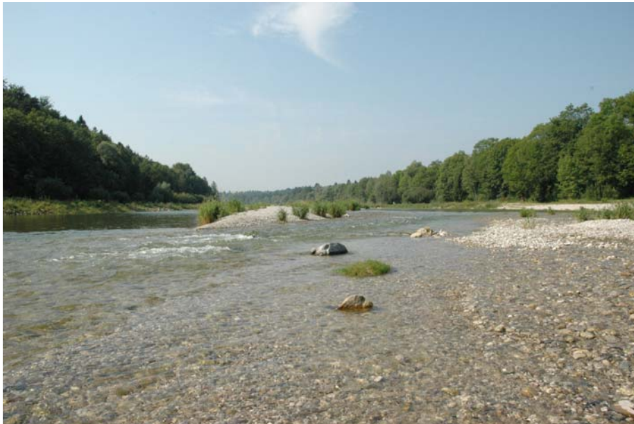
Fig. 3: Broadening of the main channel bed

After removal of the cross-river sills that are fixed under water by sheet pile walls, a 25 cm thick filter layer (particle size distribution U = 2 ) with a particle diameter d_{50} = 40 is installed. The fill of the ramp body is implemented with a 1 : 15 to 1 : 25 gradient and is made of armor stone with a diameter d = 20 to 50 cm. The course thickness is 60 cm. The superstructure comprises stone blocks with edge lengths of between 0.9 and 1.3 meters that are placed in the fill of the ramp body in the flowing water body, without intermediate spaces.