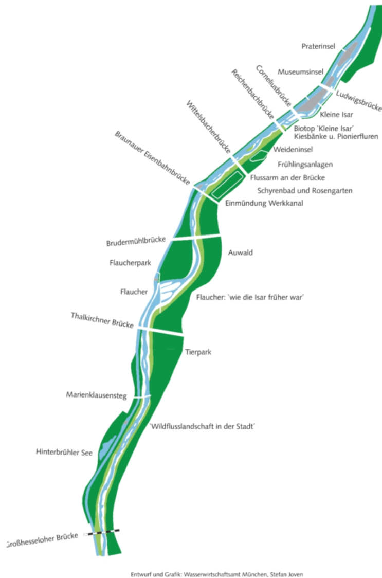
Fig. 1: Map of the “Isar Plan” project

Before hydraulic regulation began in the middle of the 19 th century, the pre-alpine River Isar flowed in the Munich area in a constantly changing river bed with extensive gravel banks and river branches. The quickly rising floodwater that brought large quantities of debris and gravel from the Alps, regularly changed the river landscape. Areas of Munich situated at lower elevations were regularly flooded (Fig. 2).