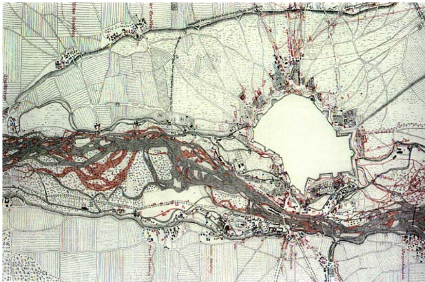
Fig. 2: Historic river course of the Isar in Munich in 1724 (black) and 1808 (grey)

The Isarauen flood meadows are extremely popular as a natural landscape and as recreation space and are one of Munich's most diversified sites for recreation activities. There is no other urban open space that is used so naturally and in such a relaxed manner as here along the “Süd-Isar” in the south of Munich. Thanks to the Isar Plan the “wild river landscape” has now returned to the city and is experienced by the urban population as a near-natural flowing body of water.