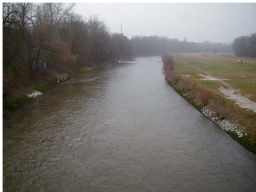
Fig. 7 and 8: Channel-like development of the Isar river bed in the urban area (“before”) and near natural development in the urban area (“after”)

To begin with, in the renaturated main channel bed with its protruding and receding stabilized banks, a number of gravel stone banks and gravel stone islands formed after smaller and average flooding.